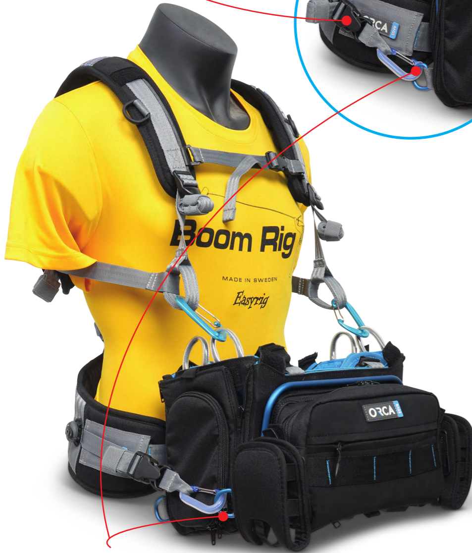
2 options for D ring connection