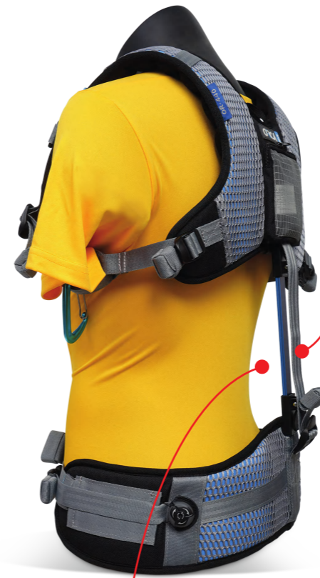
Aluminum Spine Support with 2 center lockers. Allows user to adjust harness height for perfect weight distribution