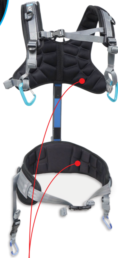
3D Memory foam for maximum comfort and airflow