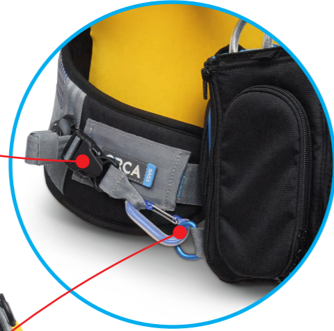
Quick release snap connection